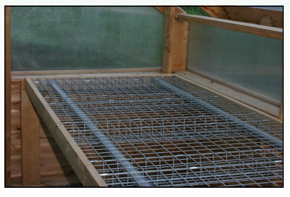
Wire Mesh Bench