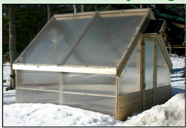
Full Height Glazing