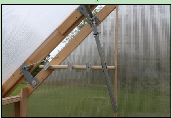
Manual Roof Opening