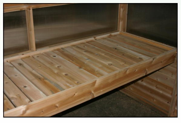
Cedar Slat Bench