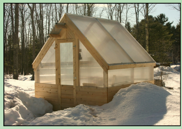
8' x 8'