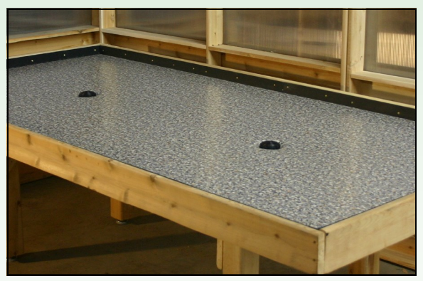
Flood Bench System

Three types of benches and one type of drip tube system are available for the Freedom Greenhouses . We offer an automatic flood bench, a bench with a cedar slat top, and a bench with a wire channel mesh top. The flood bench and the drip tube system are both automatic irrigation systems, and are regulated by timers. Benches and drip tube systems are available for one or both sides of 8' wide greenhouses.