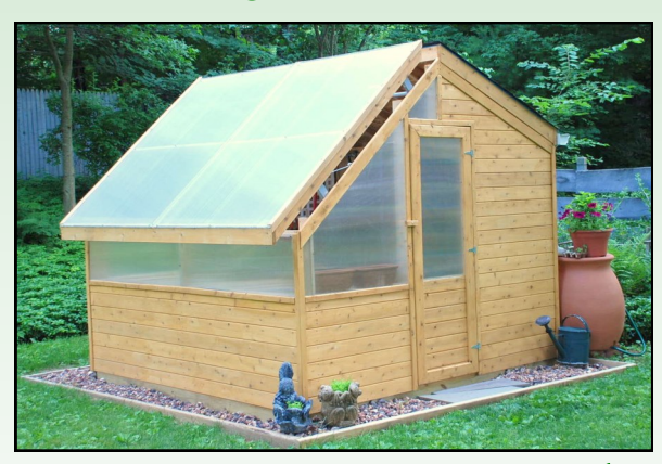
8'x 8' & 8'x 12' Greenshed

Maine Garden Products 67 Lagrange Rd. Howland, ME 04448 207-236-2600 info@mainegarden.com www.mainegarden.com