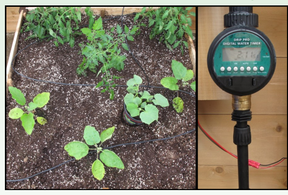
Drip Tube System